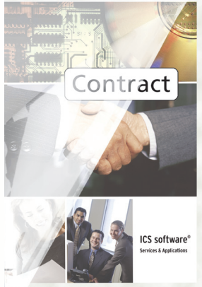
Mat finish in front and crystal in the back