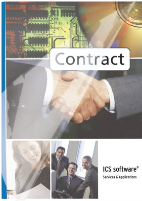
Crystal finish in front and mat in the back